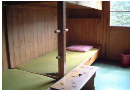
Bed in an 8-bed room